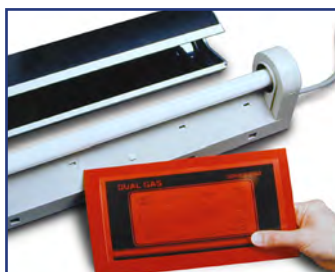
Expose to UV Light