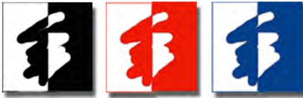
Black on White Polyester