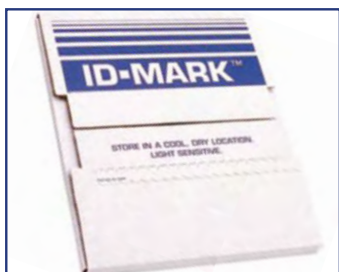
Start with ID-MARK sheets