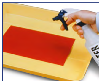
Spray with water