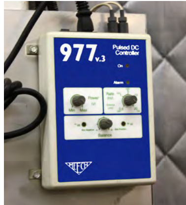
ID-MARK allows you to identify and customize equipment labels.