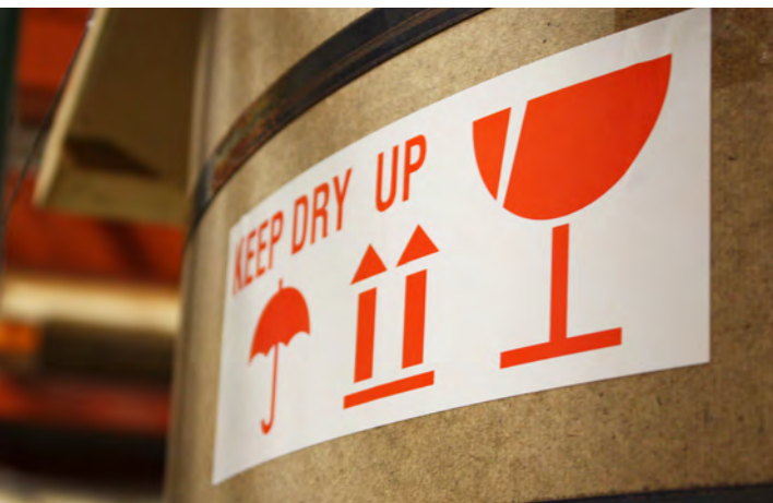
ID-MARK ensures safety signs are prominent throughout your operation.