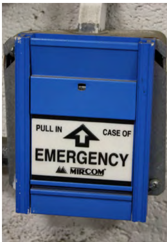
Directional nameplates are clear and recognizable