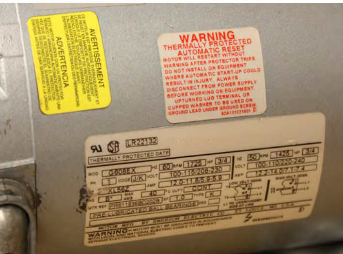
Equipment Tags - Create serialized rating plates.