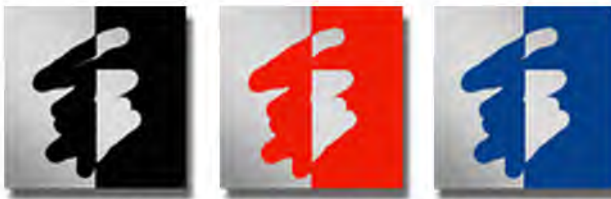
Black on Silver Aluminum