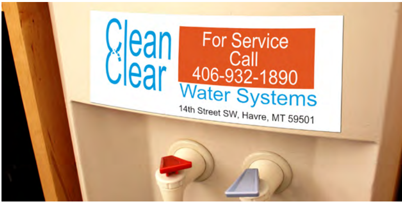
Service Call identification tags.