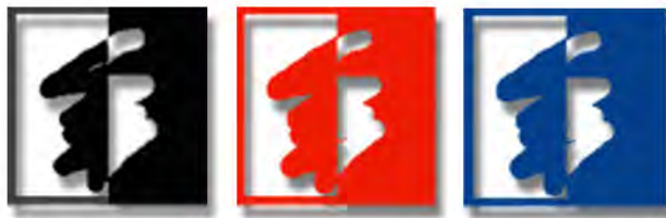
Black on Transparent Polyester