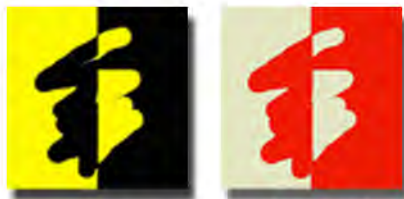
Black & Yellow Polyester