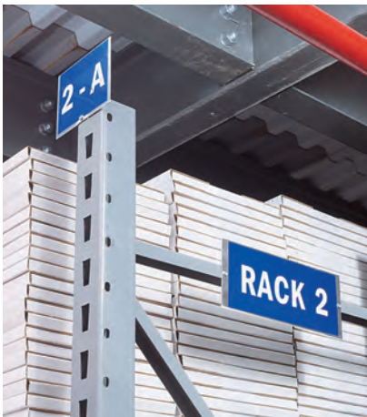
Use ID-MARK to make sure safety signs are prominent throughout your operation. Mark equipment and machinery with your logo and/or important information

The Magazine For Awards & Engraving Professionals