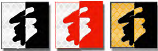
Black on White High-Intensity Reflective