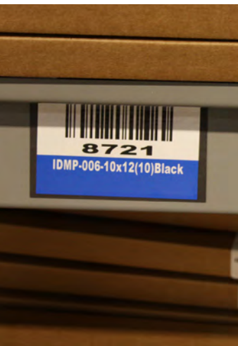
"On-demand" and "just in time" for all your in-plant operational needs.