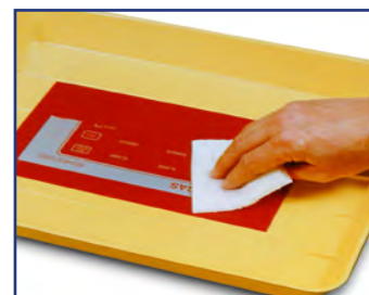
Wipe it dry