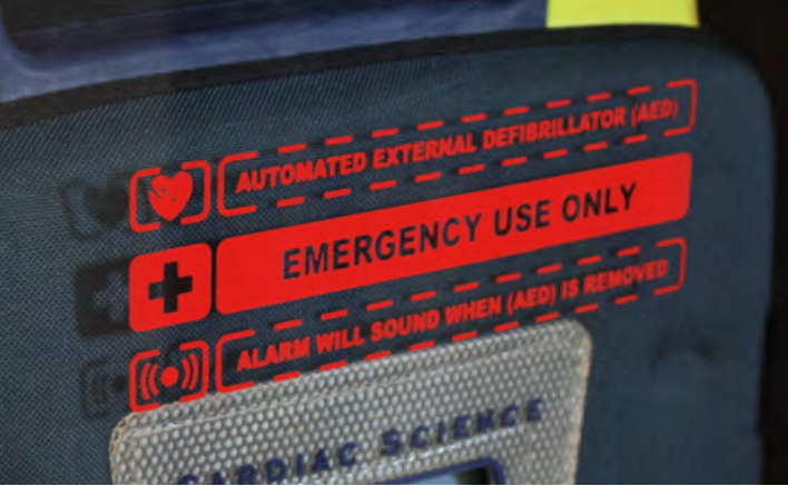
Use ID-MARK to create transparent door or window decals.